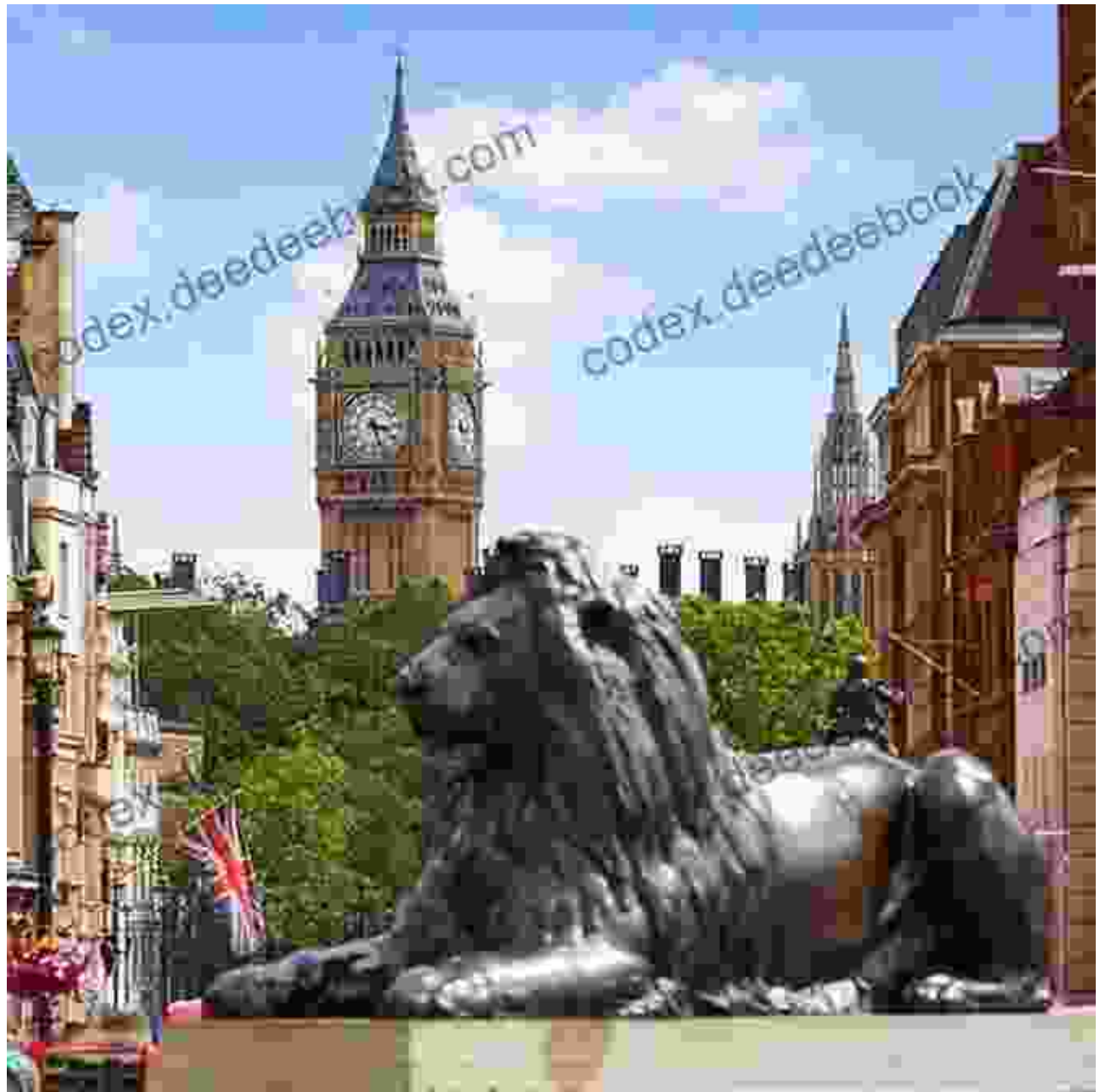
Trafalgar Square, a vibrant public space adorned with fountains and the iconic Nelson's Column.