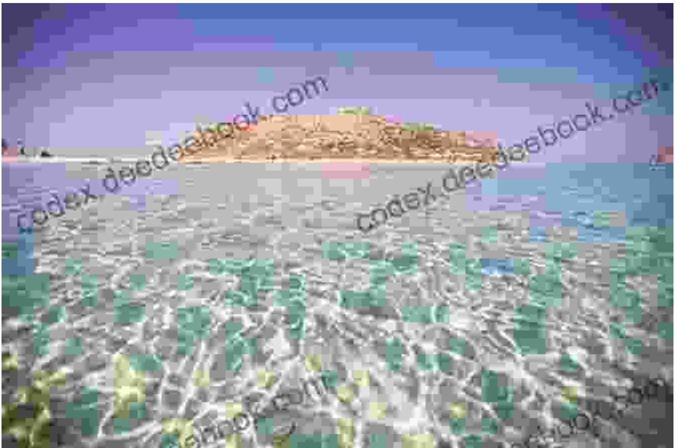
Ancient Ruins and Modern Wonders