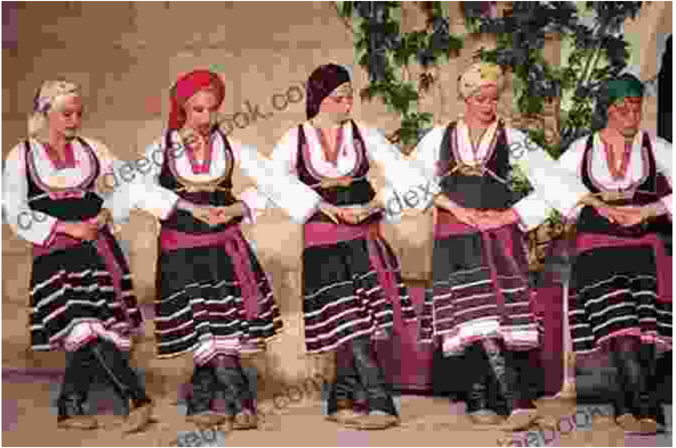
The lively and expressive Greek folk dance, passed down through generations