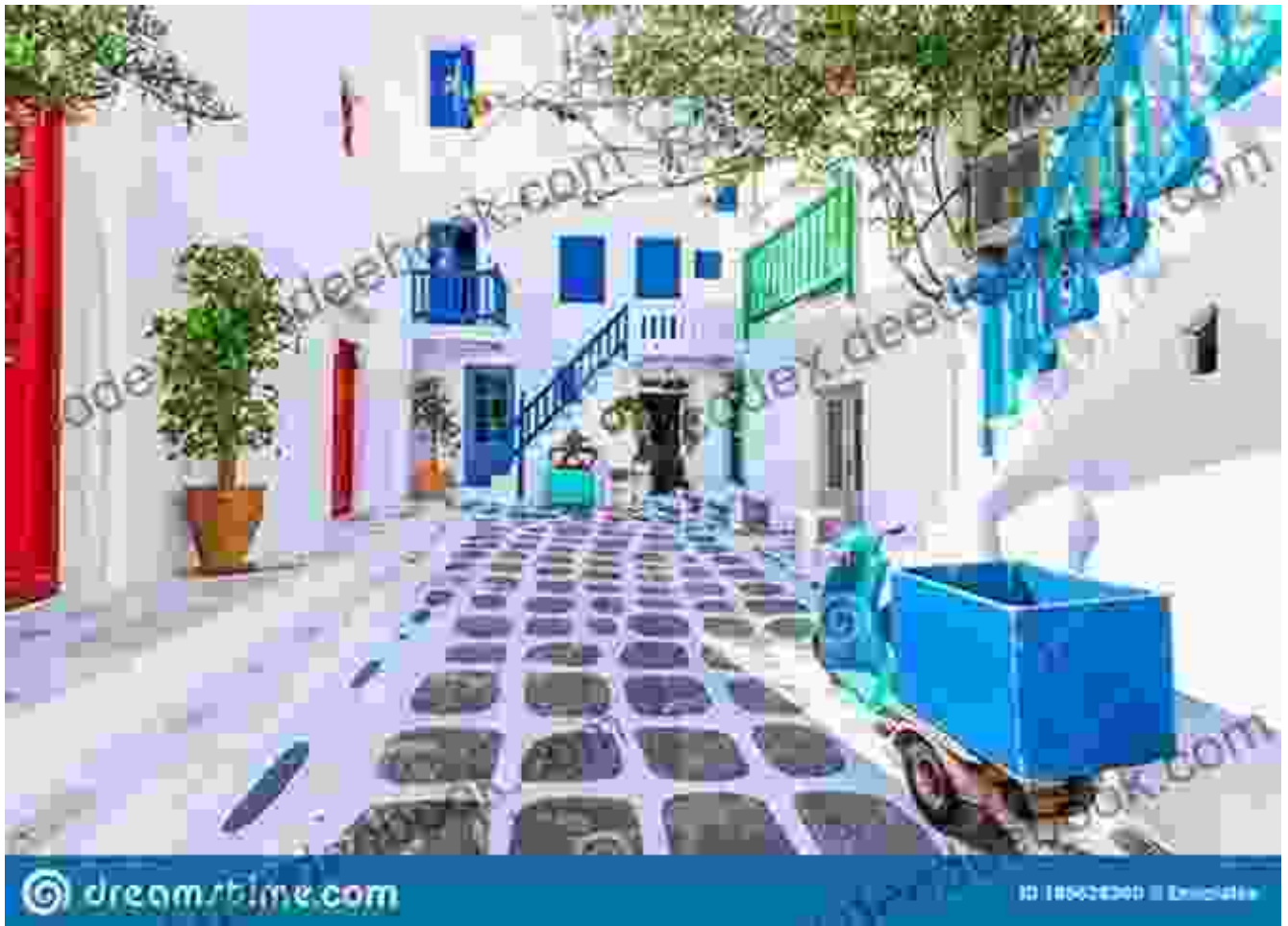
The picturesque villages of Greece, where tradition meets modernity