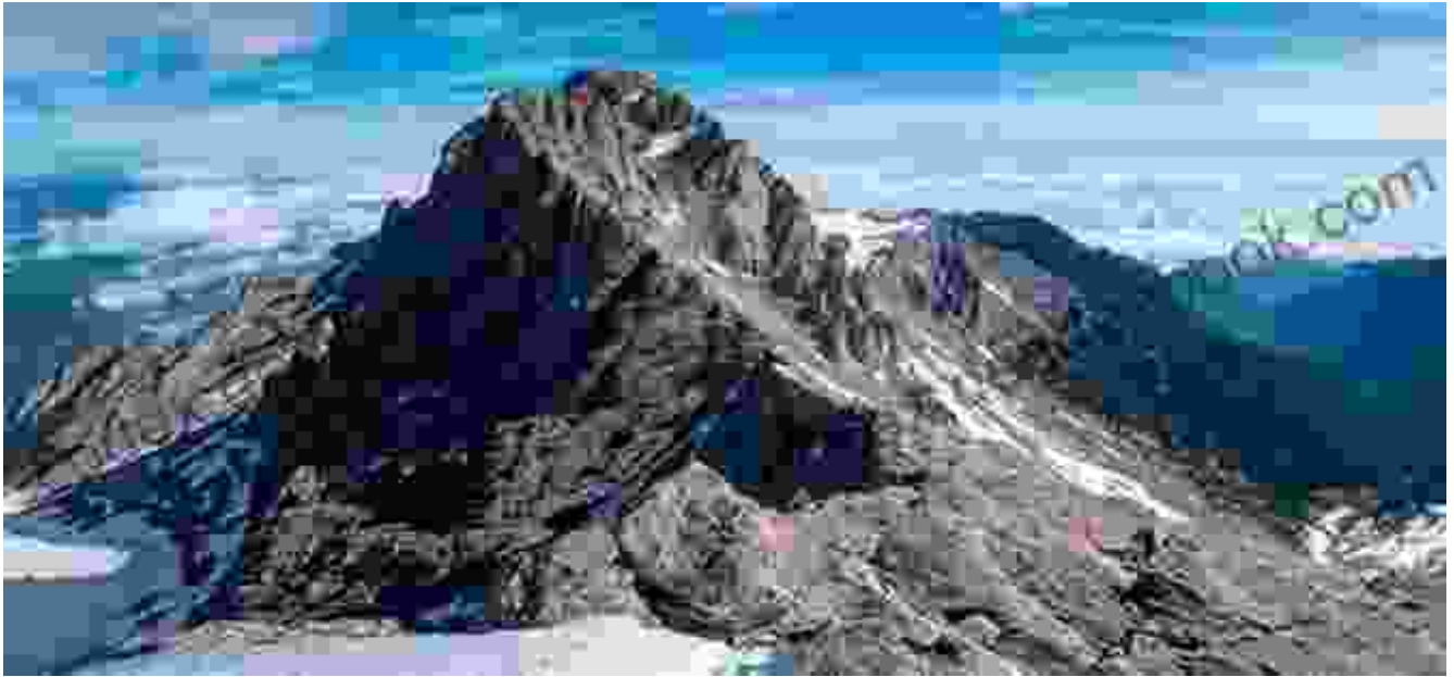
The awe-inspiring Mount Olympus, home to the gods of Greek mythology