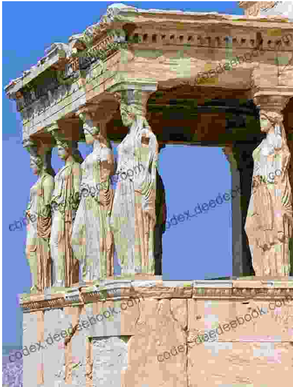
The Parthenon, a timeless symbol of Athenian glory

Greece is a living testament to its rich past. Scattered throughout the country are ancient ruins that speak to the grandeur of bygone eras. From the Acropolis of Athens to the Temple of Zeus at Olympia, these architectural marvels offer a glimpse into the birthplace of Western civilization.