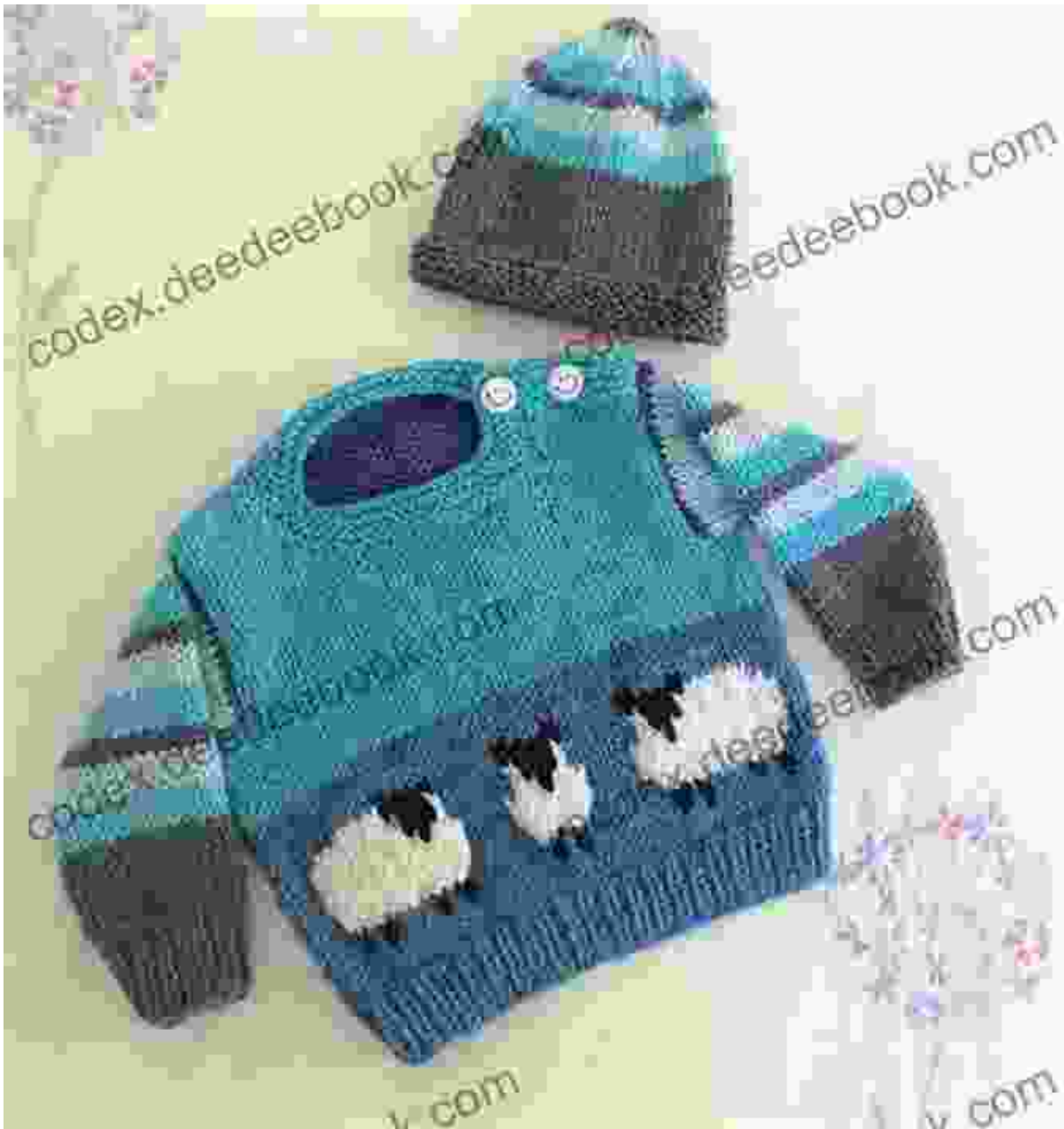
The sheep at Marydale Farm are using their nimble hooves to knit wool sweaters on Topsy Turvy Day.